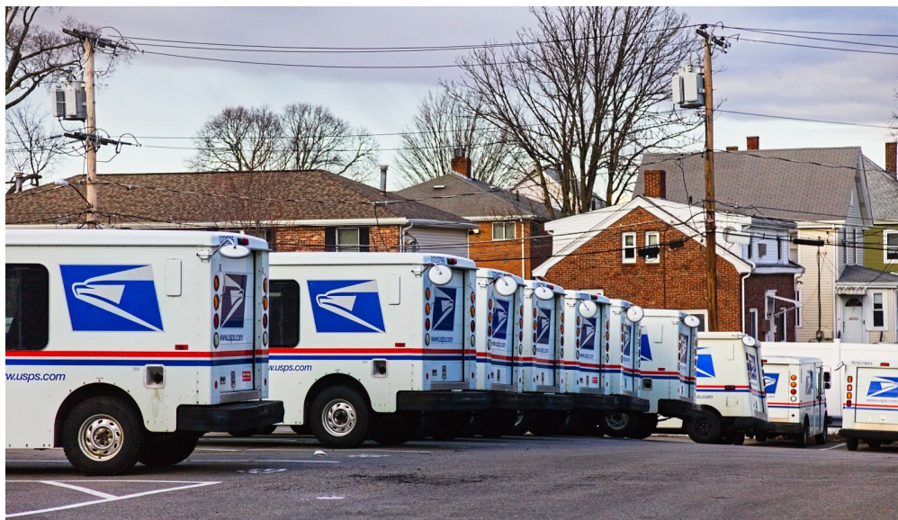
United States Postal Service vehicles lined up in Waltham, Massachusetts

Amid these fears, Postmaster General Louis DeJoy—the chief executive in charge of the U.S. Postal Service—recently testified before Congress about several changes to the agency’s operations, including the reduction in overtime pay and the dismantlement of several hundred high-speed mail sorters . He also responded to the worries sparked by President Trump’s remarks that such changes might compromise the use of vote-by-mail delivery right before the 2020 election. The future of the USPS, including both its long-term financial trajectory and imminent vote-by-mail competency, is not entirely clear. Nonetheless, voters around the country can help increase the likelihood that their ballots arrive on time by requesting an absentee ballot as early as possible and by mailing in their completed ballot by October 27 at the latest, a week before Election Day.